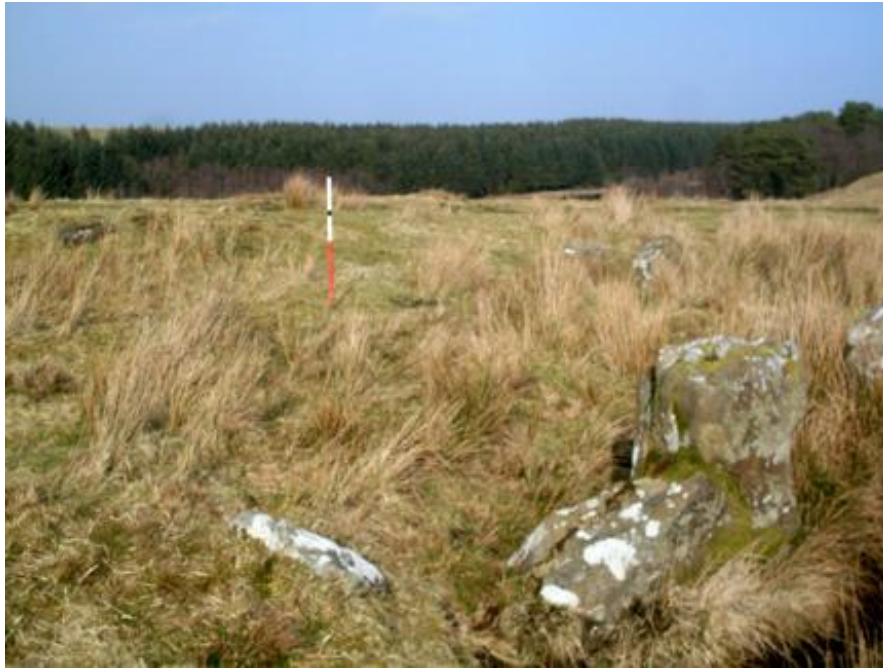
Fig 3.8. Stone circle looking north-east up the slope.