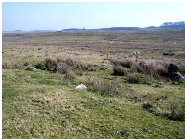
Fig. 3.6 HER 7835 Stone Circle from north-west.

The Level 1 survey reports notes “At NY 80216 71203 there is a scheduled monument ‘stone circle’ (HER 7835, SM 20976). There are aspects of this monument that posed questions for us. Although three of the 11 recorded stones stand to a reasonable height, two at 0.6m and one at 1.0m, the remaining stones are barely above surface level (0.1m). On a previous visit during 2012 a total of 13, possibly 14, stones were counted and distances between them measured, raising additional questions. The low-lying stones, which do not look like mere packing stones, are quite evenly spaced and on the northern side of the circle seem set into the rising slope (Figs 3.6 & 3.7). The fairly even spacing suggests that it is unlikely that larger stones have been robbed out. We considered whether the subsequent peat growth had led to a significant rise in surface level, but the two largest stones are in the wettest part of the site and the proximity of the ridge to the low-lying stones suggested that this is an unlikely explanation. The circle is located on sloping ground (Fig 3.6).