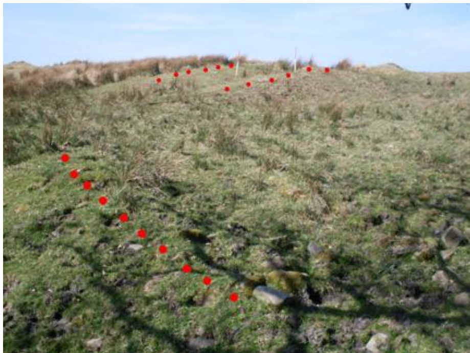
Fig 3.13 Romano-British settlement, looking N-W from western section of southern enclosure bank towards double bank.

D 5. The Romano-British settlement is partly overlain by a modern walled plantation and there is a strong likelihood that it has been partially robbed-out when the subsequent walling was built. However there are interesting features still visible on the surface, particularly the double bank still extant on its western side (Fig 3.13).