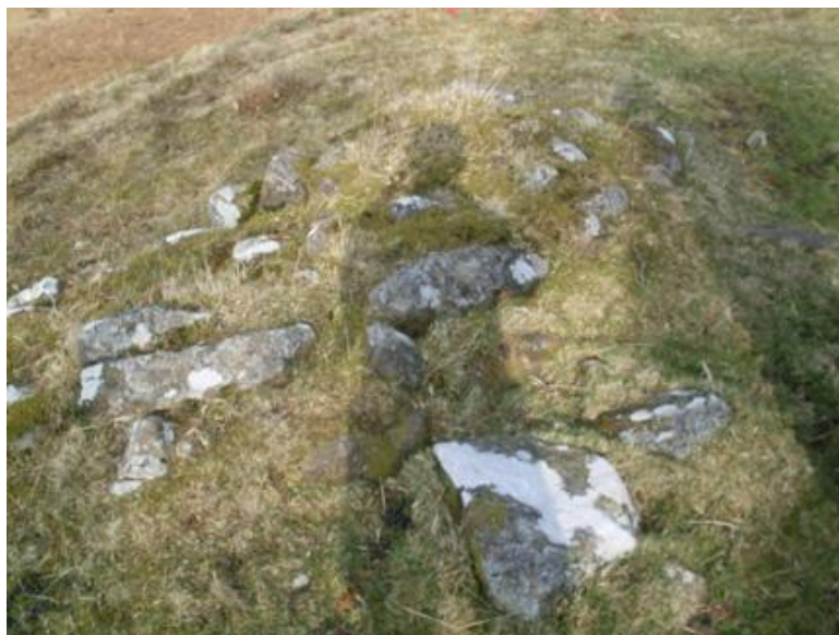
Fig 3.11 Possible remains of boundary wall

D 3. Close to the northern end of the N-S linear bank at NY 80183 71207 there is a short (3.5m) linear grouping of stones (Fig 3.11) suggestive of wall remains. Intermittent stones are visible aligned along the ridge towards the northern edge of the Romano-British settlement to the west.