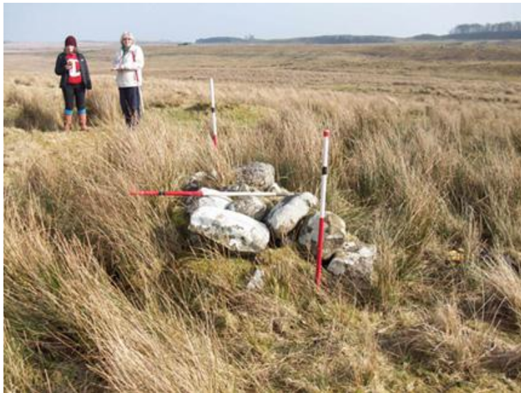
Fig 3.10 Rectangular cairn

D 2. Just west of the northern end of this bank is a small roughly rectangular cairn (Fig 3.10), 2.3m by 1.3m, 0.5m high. The team recording this feature commented that it appears to be kerbed. Its long axis is aligned E-W, as are the exposed cists (HER 22623 and 22624) to the west of the Romano-British settlement. The team were struck also by the similarity of dimensions between the cists and this cairn.