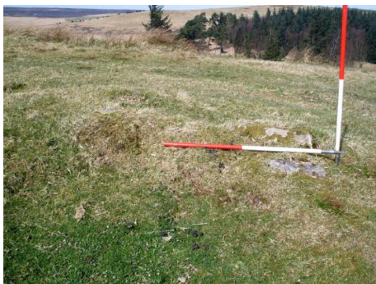
Fig.3.7 Low-lying stones in slope looking north.