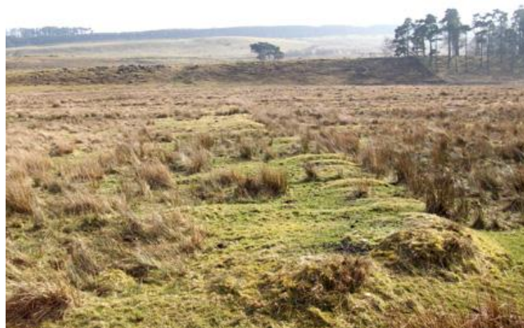
Fig 3.9 Low earthen bank east of Romano-British settlement.

D 1. A linear earthen bank (2.5m wide, 0.25m high) with a few large stones runs down the slope for 65m from near the ridge at NY 80190 71209 to the boggy area at 80205 71143 (Fig 3.9). There is a slight ditch on its western side, but this does not appear to be a modern drainage feature.