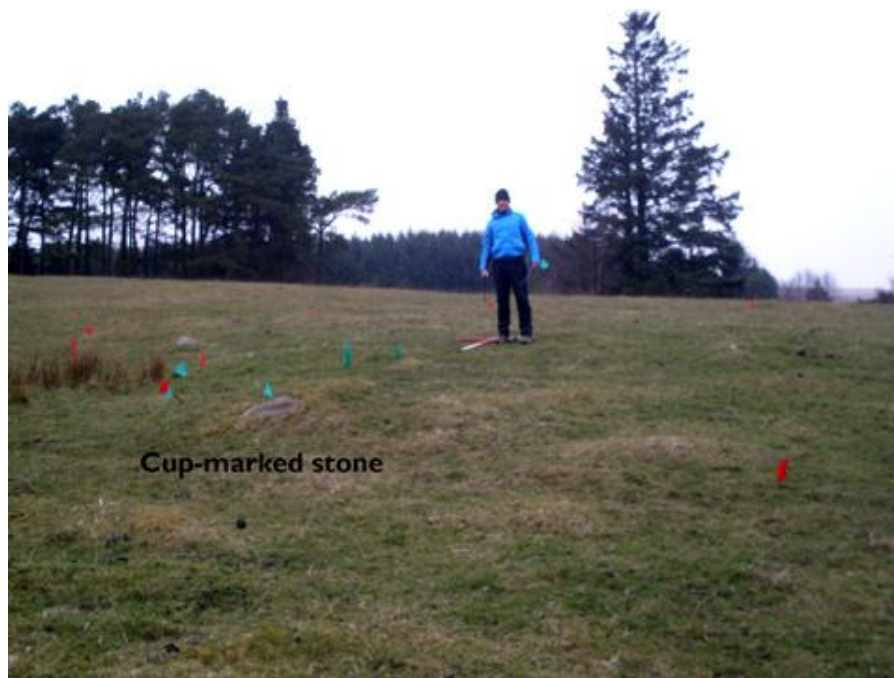
Fig 3.4. Possible cairn with cup-marked stone

relationships between cairns and prehistoric boundary features, and between burial cairns and cup-marked stones, we feel that this conjunction of features warrants closer examination during our Level 3 survey.”