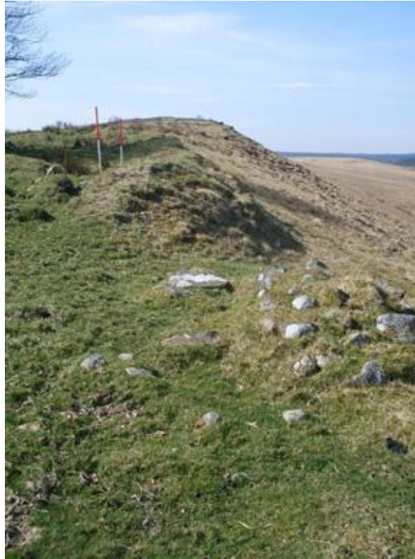
Fig 3.12 Stony mound HER 22624 and Romano- British settlement.

D 5. The Romano-British settlement is partly overlain by a modern walled plantation and there is a strong likelihood that it has been partially robbed-out when the subsequent walling was built. However there are interesting features still visible on the surface, particularly the double bank still extant on its western side (Fig 3.13).