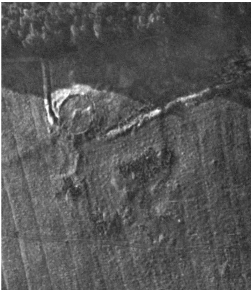
Figure 3-2: Aerial view of circular enclosure HER 7857 and earthworks

Although the HER entry refers to the circular enclosure as the possible remains of a robbed-out barrow this interpretation was queried by group members during the Level 1 survey. Tim Gates's aerial photograph shows clearly a distinct continuous circular