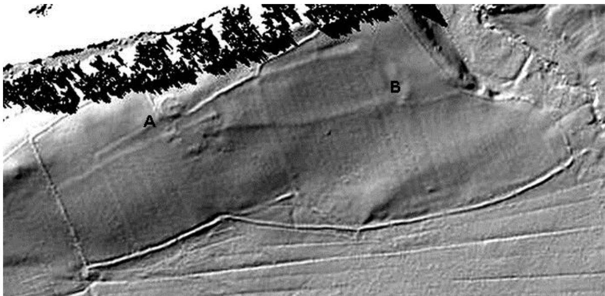
Figure 3-3: Lidar image of Davy's Lee Enclosure

bank plus a central mounded feature which extends eastwards to the circular bank. The sod- cast perimeter bank of Davy's Lee Enclosure, which bends sharply around HER7857, appears to incorporate the southern arc of the circular enclosure before resuming its sod-cast structure immediately south-east of HER 7857. Immediately to the south lie a number of earthwork banks. The summary report of the March 2015 Level 1 survey notes as follows: "These consist of two parallel lengths (the longest 18m by 0.2m high) of banked platform with a possible arced connecting bank and a short (2m) low (0.2m) bank located perpendicularly between the two linear features, but not joined to either. Just to the west of these earthworks are two further roughly semi-circular low (0.1m to 0.2m) arcing banks each of about 10m diameter. It would be premature to attempt interpretation of this cluster of features. We have noted above the possible coincidence of the linear platforms with the features visible on the Lidar images (See Fig 3.3). Given the proximity of the large circular enclosure HER 7857 to these earthworks it may be appropriate to investigate further any potential relationship between these features during the Level 3 survey."