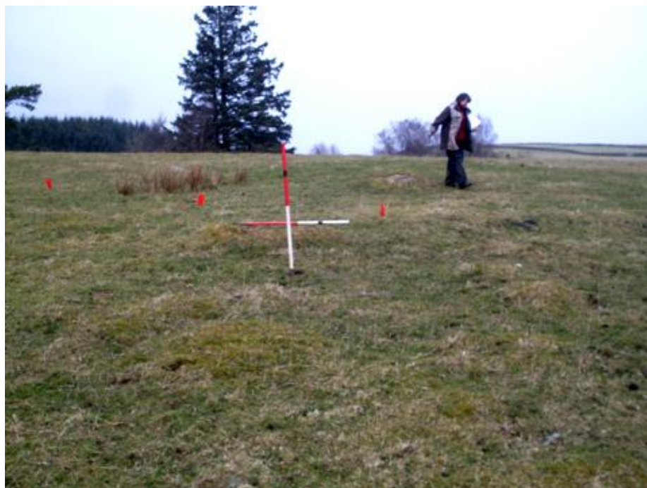
Fig 3.5. Banked platform south of possible cairn