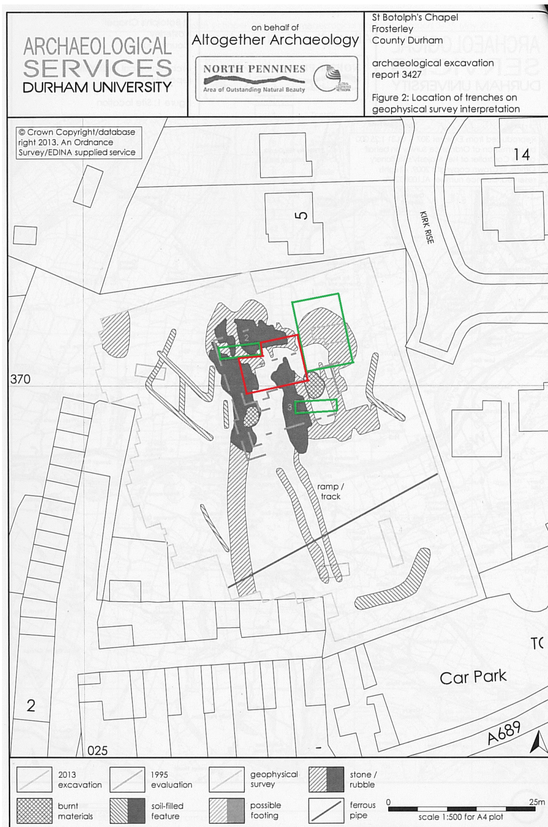
Fig 8.1. Location of proposed 2014 excavation trench (in RED), shown in relation to the 2013 trenches (in GREEN). The 2014 plans also include the further investigation of Trench 3. Note that trenches are subject to extension or alteration during fieldwork, by agreement with English Heritage. See text for further details. (Base plan is reproduced from ASDU 2014).