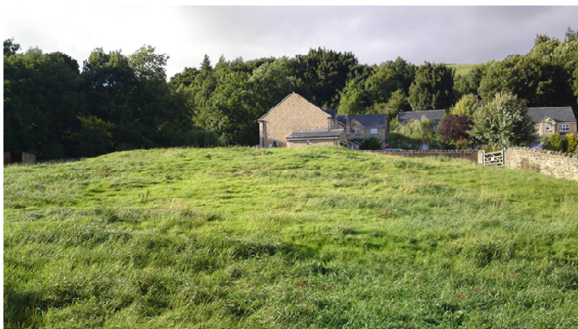
Fig 3.1, above. Aerial view of St Botolph's within the village of Frosterley..