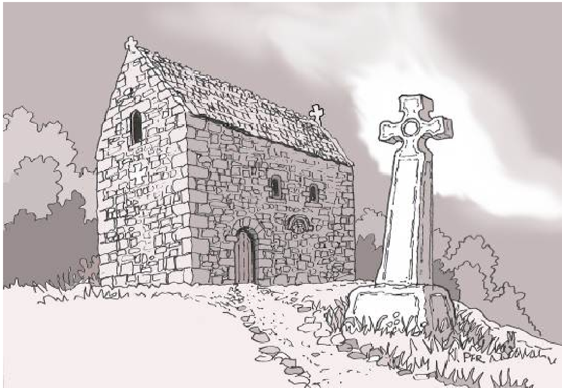
Fig 3.7. Sketch showing how the chapel may have appeared in Anglo-Saxon times, by Peter Ryder. This uses evidence from the 2013 excavations coupled with knowledge of comparable sites elsewhere, most notably Escomb.