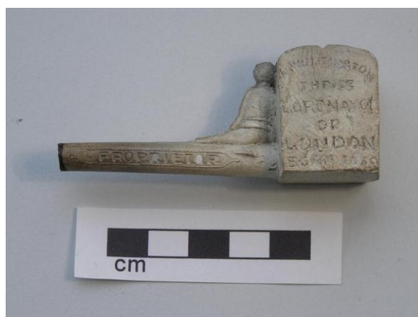
Photo 11. Other side of the square pipe with the legend “R. Whittington, Thrice Lord Mayor of London, Born 1350” and “Proprietor” on the stem.