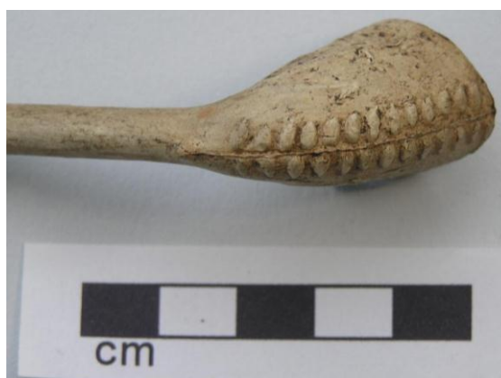
Photo 5. Leaf or branch design on pipe bowl seam to cover up any misalignment in the mould halves.

Some London pipe makers produced rare decorated bowls incorporating heraldic art at this time and leaf or barley patterns were commonly used to cover seams on the bowl, as shown in Photo 5 below.