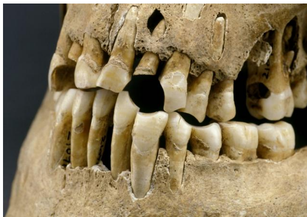
Photo 9. The effect of gripping a cutty pipe between the teeth for long periods while working.

Decorated pipes greatly increased in number and were often used for advertising purposes. They were called “fancy clays” or “fancies” and bore size had fallen to a low of \frac{4}{64} (1.6mm). This was the high point in clay pipe variety and design, when use was at its highest.