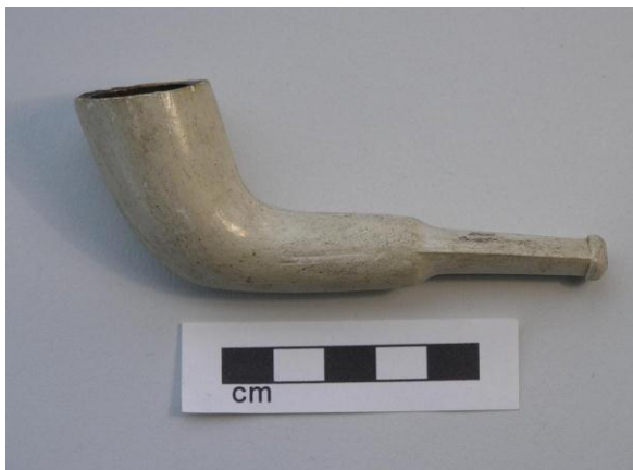
Photo 8. A cutty or short pipe used by workers. It has a cream wash to mimic the appearance of a meerschaum pipe.

After 1850 the “yard of clay”, or churchwarden, pipes up to 36” (900mm) in length first appeared. The working man, however, still preferred a short stem pipe (called cuttys or nose warmers and shown in Photo 8) that could be gripped between the teeth while they carried on working. The results (shown below in Photo 9) are obvious!