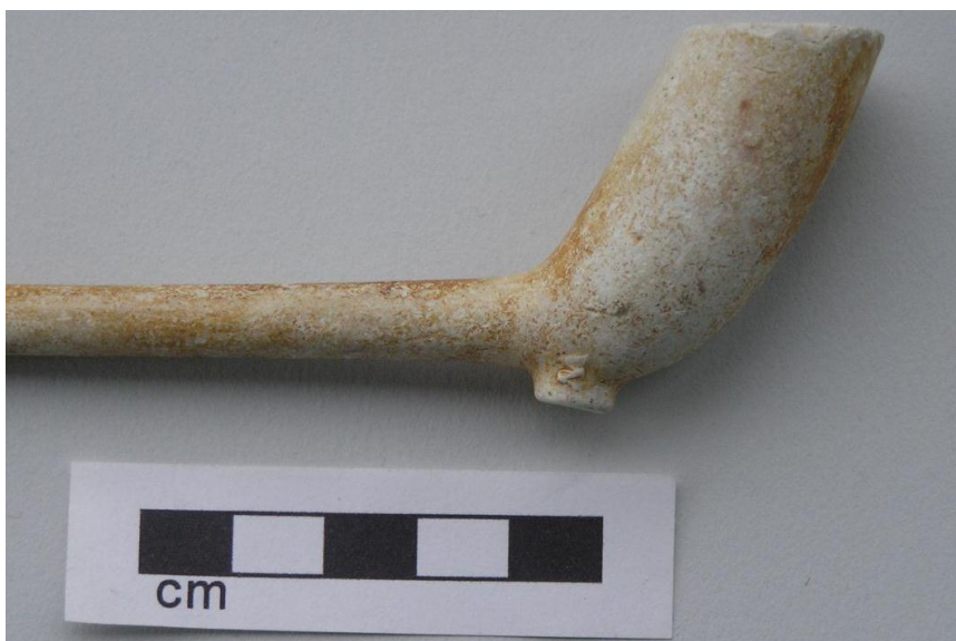
Photo 4. Post-1700 pipe with the bowl rim trimmed parallel to the pipe stem. Note the letter W on the heel, this denotes the maker's surname began with W. On the left hand side of the heel is the letter I (often used in place of J) representing the Christian name.

Shortly after 1700, pipes changed in quality, being more accurately made, with a smoother finish and with thinner walls and slender stems. The top of the rim was now trimmed parallel to the stem, as shown in Photo 4. This also shows the maker's letter W on the side of the heel.