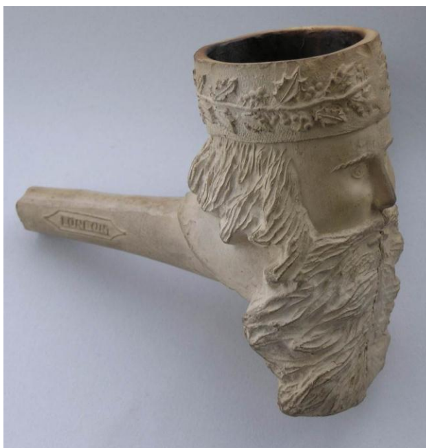
Photo 14. An example of a cadger pipe in the form of St Nicholas' head

Another novelty type is the “cadger” design, which featured a large bowl capable of holding much more tobacco than a normal pipe. An example is shown in Photo 14, in the form of a St. Nicholas head. The name reputedly comes from the story that, when people offered you a fill of tobacco, you took out the cadger rather than the normal size pipe and so gained an extra supply.