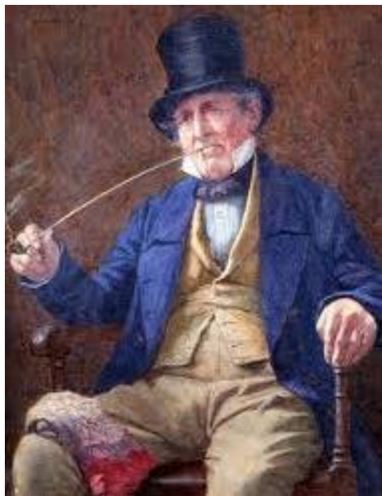
Figure 1. Detail from a painting showing an elderly gentleman smoking an alderman pipe

Early 18 th C pipes often had flat-bottomed (pedestal) spurs or no spurs at all. By the mid-18 th C very long pipes were introduced – called alderman or straws – which were 18 – 24” (450 – 600mm) long and with a bore diameter averaging \frac{3}{32} ” (2.4mm). They were made for leisure smoking (see Figure 1 below).