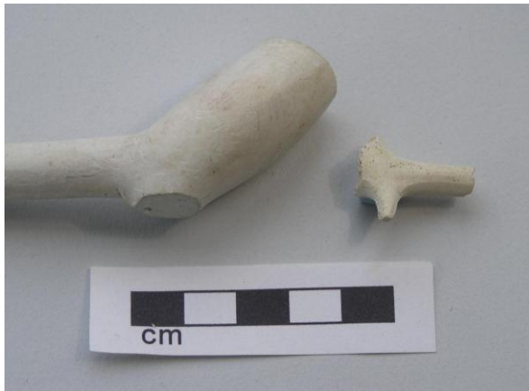
Photo 1. Photograph showing the difference between the flat heel on the left and the pointed spur on the right.

By 1640 the bowl inside diameter had increased to about \frac{3}{8} " (9.5mm) as tobacco prices continued to fall, although stem lengths remained basically the same. After this date the bowl grew larger and the stem increased to 10 – 14" (250 – 350mm). A pointed spur replaced the flat heel (see Photo 1 below) and this design became the standard for the next 60 years. Milled or plain rings (see Photo 2 below) round the rim and occasionally a maker's mark appeared, although generally 17 th C pipes were plain.