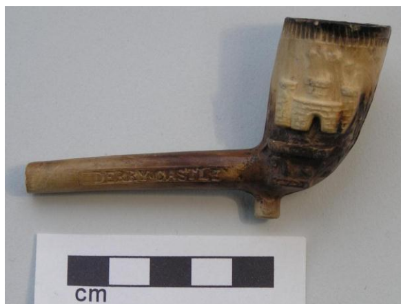
Photo 7. Pipe with 27 th Inniskilling Regiment insignia and Derry Castle as their garrison town