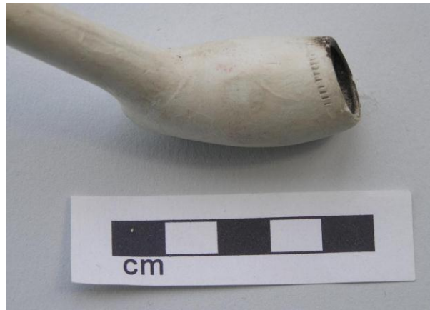
Photo 2. Photograph showing the milling marks just below the rim of the bowl.

By 1700 the bowl had become more elongated with an inside diameter of about \frac{1}{2} " (13mm) and the stem had a bore of from \frac{3}{32} " – \frac{1}{8} " (2.4 – 3mm). The comparison in