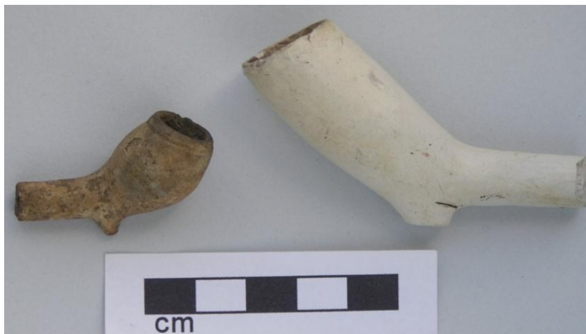
Photo 3. Photograph contrasting the size of a typical 1610 period pipe on the left with the 1710 period pipe on the right.

Photo 3 below shows the difference in size between typical 1610 and 1710 pipe bowls.