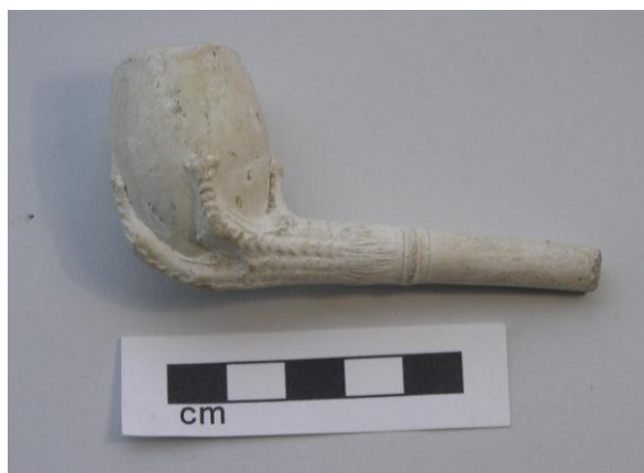
Photo 12. A popular “claw holding an egg” type, a variant has a human hand instead of the claw.

Some other novelty types are shown in Photos 12 and 13.