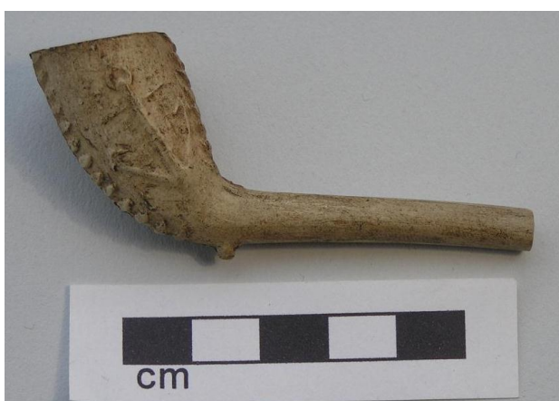
Photo 6. Pipe probably advertising a pub called The Anchor.

By 1750 pipes with masonic arms, public house symbols and military regimental badges were all being made, examples are shown in Photos 6 and 7 below.