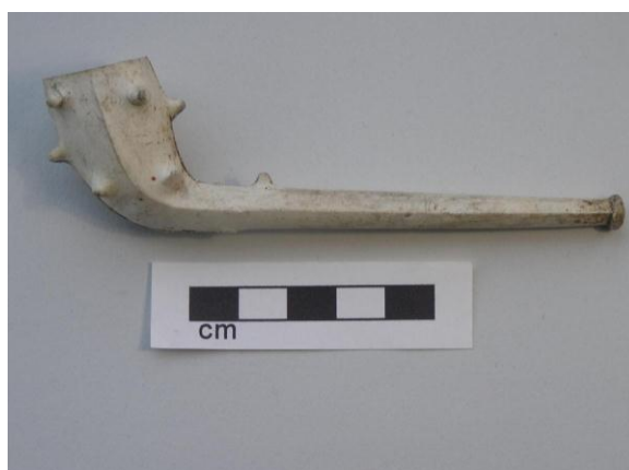
Photo 13. An example of a thorn pipe, representing a briar pipe where the prickles are shown on the bowl.

Another novelty type is the “cadger” design, which featured a large bowl capable of holding much more tobacco than a normal pipe. An example is shown in Photo 14, in the form of a St. Nicholas head. The name reputedly comes from the story that, when people offered you a fill of tobacco, you took out the cadger rather than the normal size pipe and so gained an extra supply.