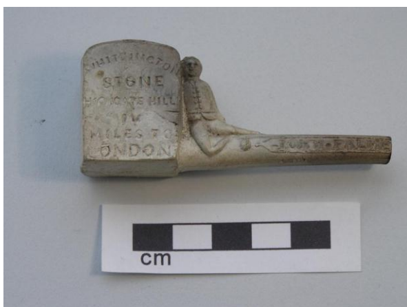
Photo 10. Square pipe representing a man resting by a milestone with the legend “Whittington Stone, Highgate Hill IV Miles to London” and “John Palme(r)” on the stem.

Decorated pipes greatly increased in number and were often used for advertising purposes. They were called “fancy clays” or “fancies” and bore size had fallen to a low of \frac{4}{64} (1.6mm). This was the high point in clay pipe variety and design, when use was at its highest.