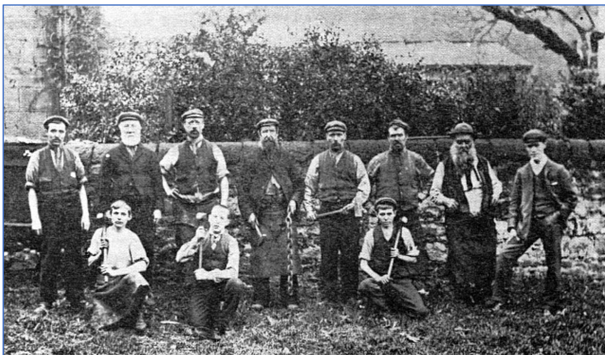
Winlaton Chainsmiths c.1900