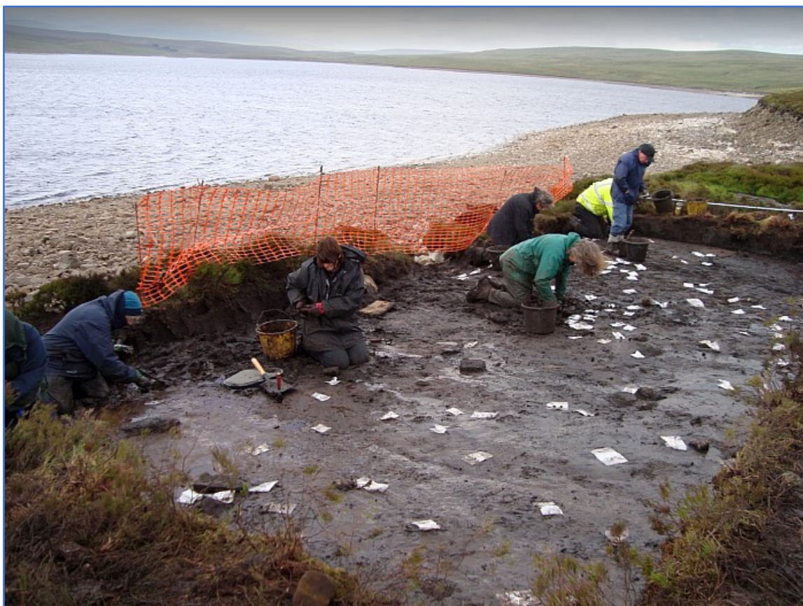
Altogether Archaeology Excavation at Cow Green reservoir in the middle of summer! Very wet but lots of cherty 'flints'.

Evidence for Mesolithic activity throughout the North Pennines is rare but offers a tantalising glimpse of a lifestyle that must have included a great deal of mobility, with people moving between different campsites throughout the year. This seasonal round, and the sites visited within it, must have been imbued with great spiritual significance amongst Mesolithic people. Myths and legends would be associated with particular places, linked to the ancestors and the cosmos, and while these are now lost, ethnographic examples from more recent times, such as the Aboriginal songlines of Australia, offer us clues as to how they may have worked. Certainly, living in the Mesolithic would have been about much more than making flint tools, hunting and gathering, but our understanding of the spiritual aspects of Mesolithic life will always be reliant on informed speculation rather than hard fact.