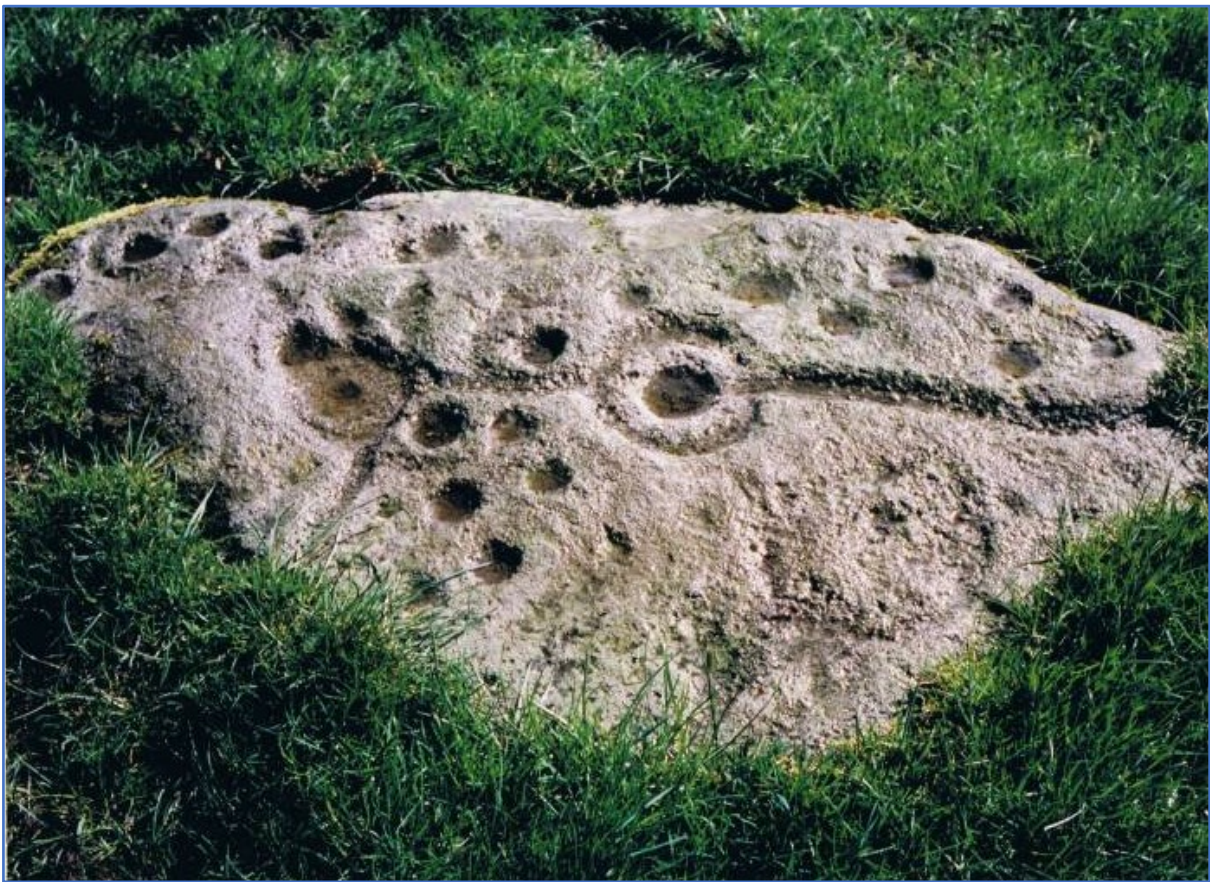
Rock Art at Howgill Head, Teesdale NY952205.

In summary we must conclude that there is frustratingly little evidence of Neolithic activity within the North Pennines, although we do have tantalising clues in the form of lithics, rock art and palaeoenvironmental evidence. It is quite possible that settlement was concentrated on the lower ground, with the high moors used for a combination of seasonal grazing and hunting. While attention is naturally drawn to the great Neolithic monuments such as Long Meg (at which further work is needed), it may be that much progress can be made through the recognition and investigation of small apparently domestic sites such as Kellah Burn. Finding these will not be easy, but rock art may provide some clues.