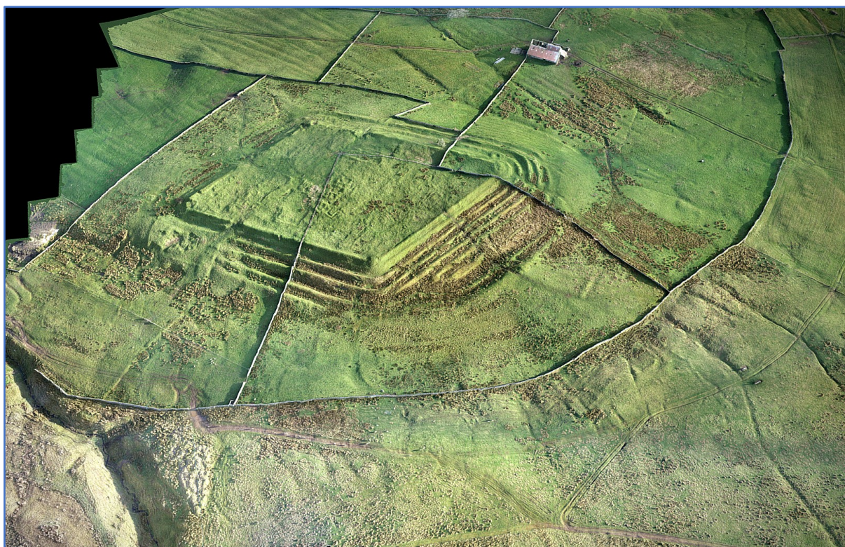
Epiacum Roman Fort near Alston.

very old. The first edition map also records the fieldname 'Chesters' here, and antiquarian accounts record the finding of Roman coins in the vicinity. Prior to relatively recent ploughing, a large earthwork enclosure existed adjacent to the river; this may have been of Roman date and could have been some kind of working camp linked to lead mining operations. However, whether or not any of this complex is actually Roman is unlikely to be confirmed without further investigation in the field. Evidence of Roman mining in the surrounding hills, and elsewhere, may well have been destroyed by subsequent larger scale activity, though there is still a fair chance that Roman sites could be identified in future.