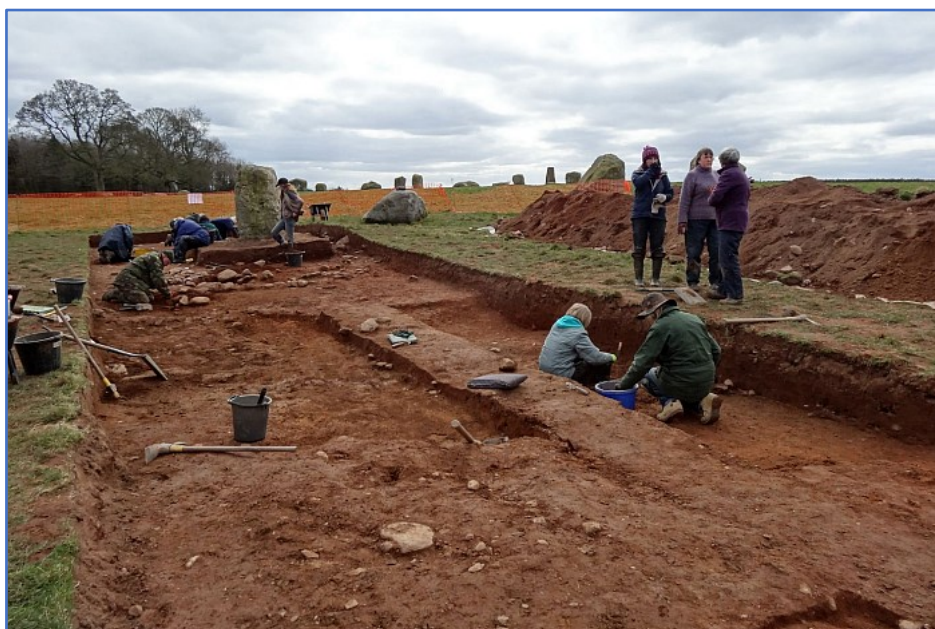
AA excavation at Long Meg and her Daughters Stone Circle.