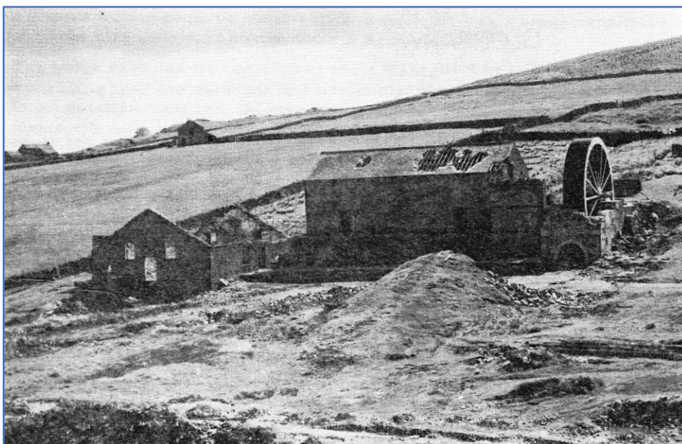
Killhope Lead Mine

As noted in its introduction, this has been but the briefest of overviews of the post-medieval archaeology of the North Pennines. Much more can be said of the rise and fall of lead mining and other industries, of traditional farmsteads and field systems, of the development of towns and villages, of religion and in particular the network of Methodist chapels, and of transport including roads and railways. Changes in the landscape during the twentieth century, including during both World Wars, and the recent development of tourism, are also subjects worthy of study. The overriding theme of post-medieval archaeology in the North Pennines will, however, always be the nature of the miner-farmer landscape, and the ways in which people exploited the industrial and agricultural potential of the area. Although much is known, there is still huge potential to find out more through a combination of archaeological field investigation, architectural survey of historic structures, and documentary studies.