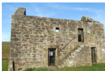
Black Middens 1